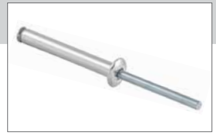
EN AW - 5019 [AlMg5]